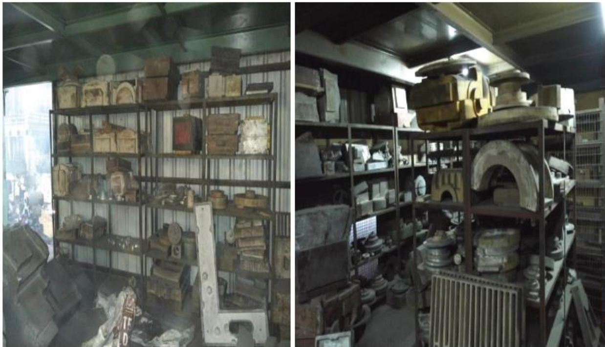
Fig : Match plate & Single piece Pattern

Raw material used for oil pump casting is cast iron FG200. For this process match plate pattern is used in which total 4 designs of oil pump are adjusted. Using pattern sand, mould is prepared by squeezing machine and fue patterns are made by hand moulding process. After preparing mould, molten metal is poured into mould cavity by melting in induction furnace. Solidification time of 20 minutes is given then cast component were obtained by