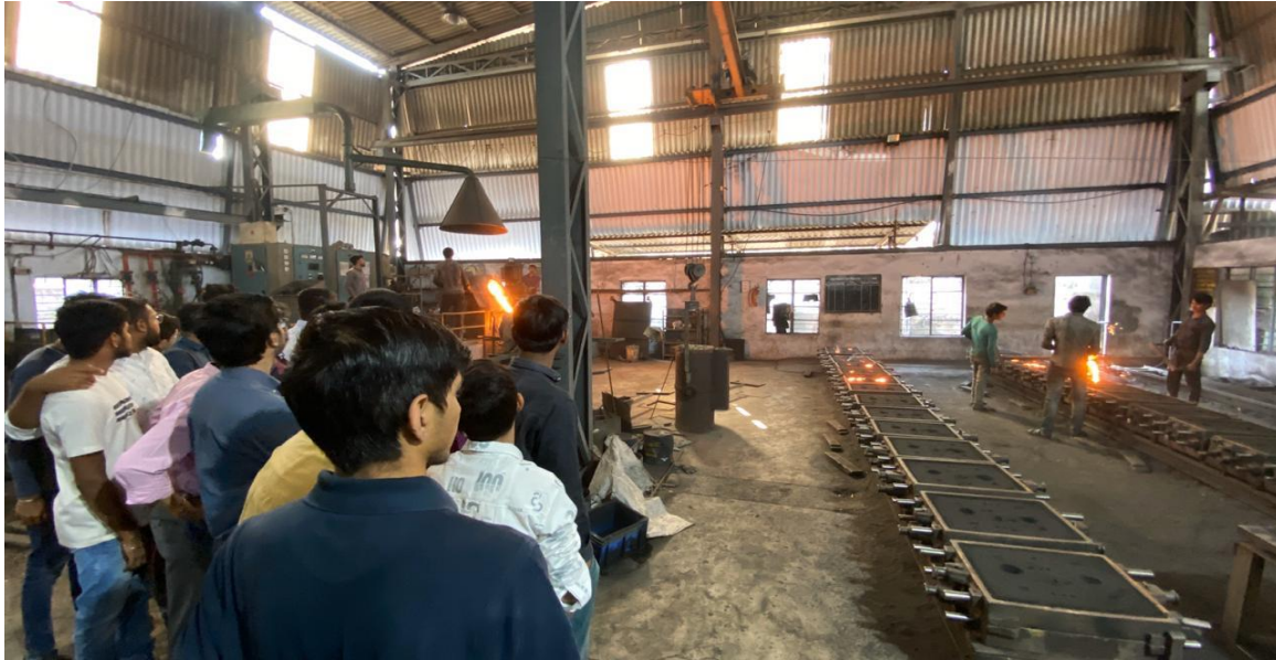
Fig: Pouring of molten metal in cavity

fettling. After obtaining solid components, machining processes were done to obtain final finished product.