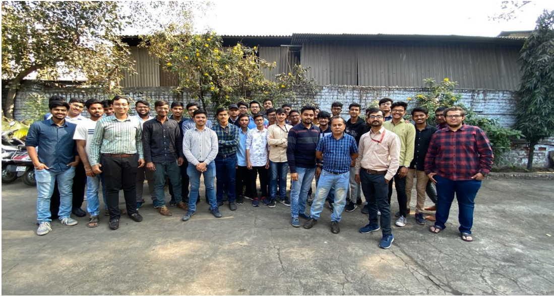
Fig : Day 1 at Sainath Industry