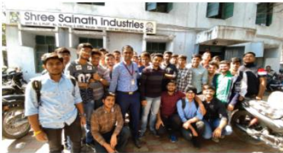
Fig : Day 2 at Sainath Industry